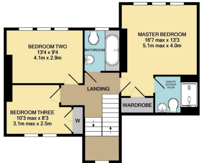
FIRST FLOOR APPROX. FLOOR AREA 608 SQ.FT. (56.5 SQ.M.)